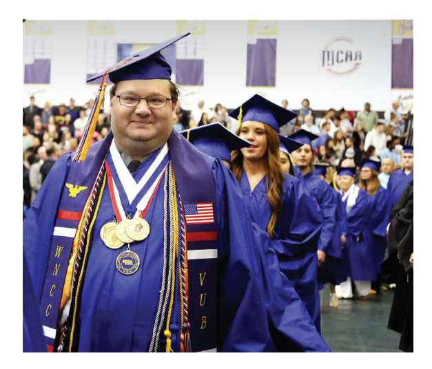
The TRIO Veterans Upward Bound program has helped veterans readjust to civilian life, focus on studies, and find new career paths for 20 years at WNCC.