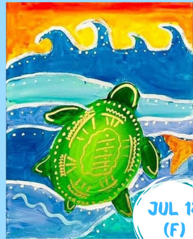
TURTLES AND WAVES