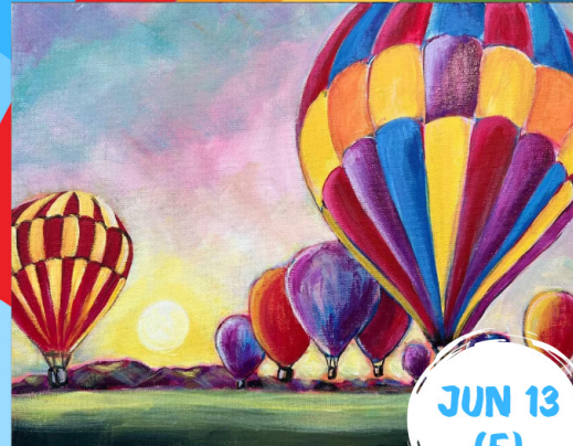
HOT AIR BALLOON