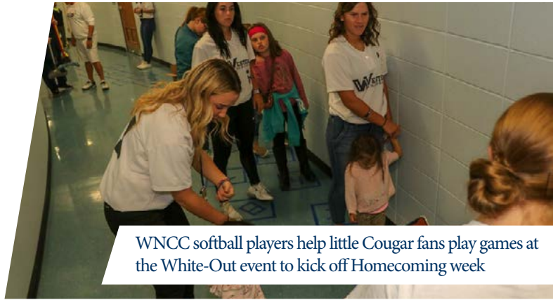
WNCC softball players help little Cougar fans play games at the White-Out event to kick off Homecoming week