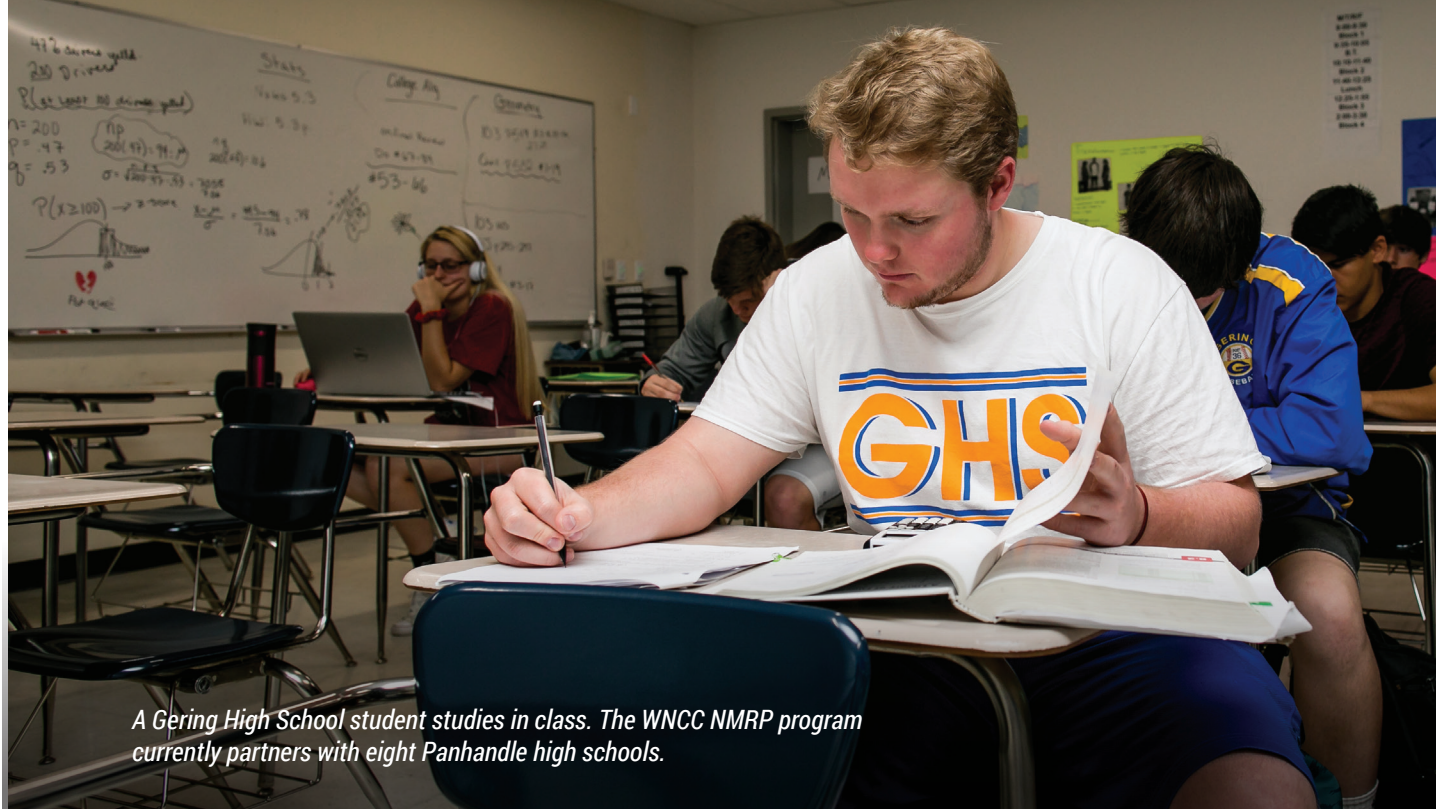
A Gering High School student studies in class. The WNCC NMRP program currently partners with eight Panhandle high schools.